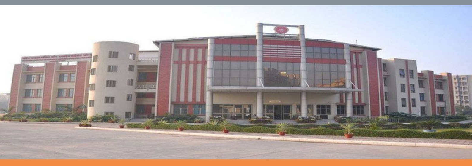
Shaheed Rajguru College of Applied Sciences for Women, University of Delhi, New Delhi - 110 096; Accredited by NAAC with 'A' grade. NIRF Rank 31 DBT Star College